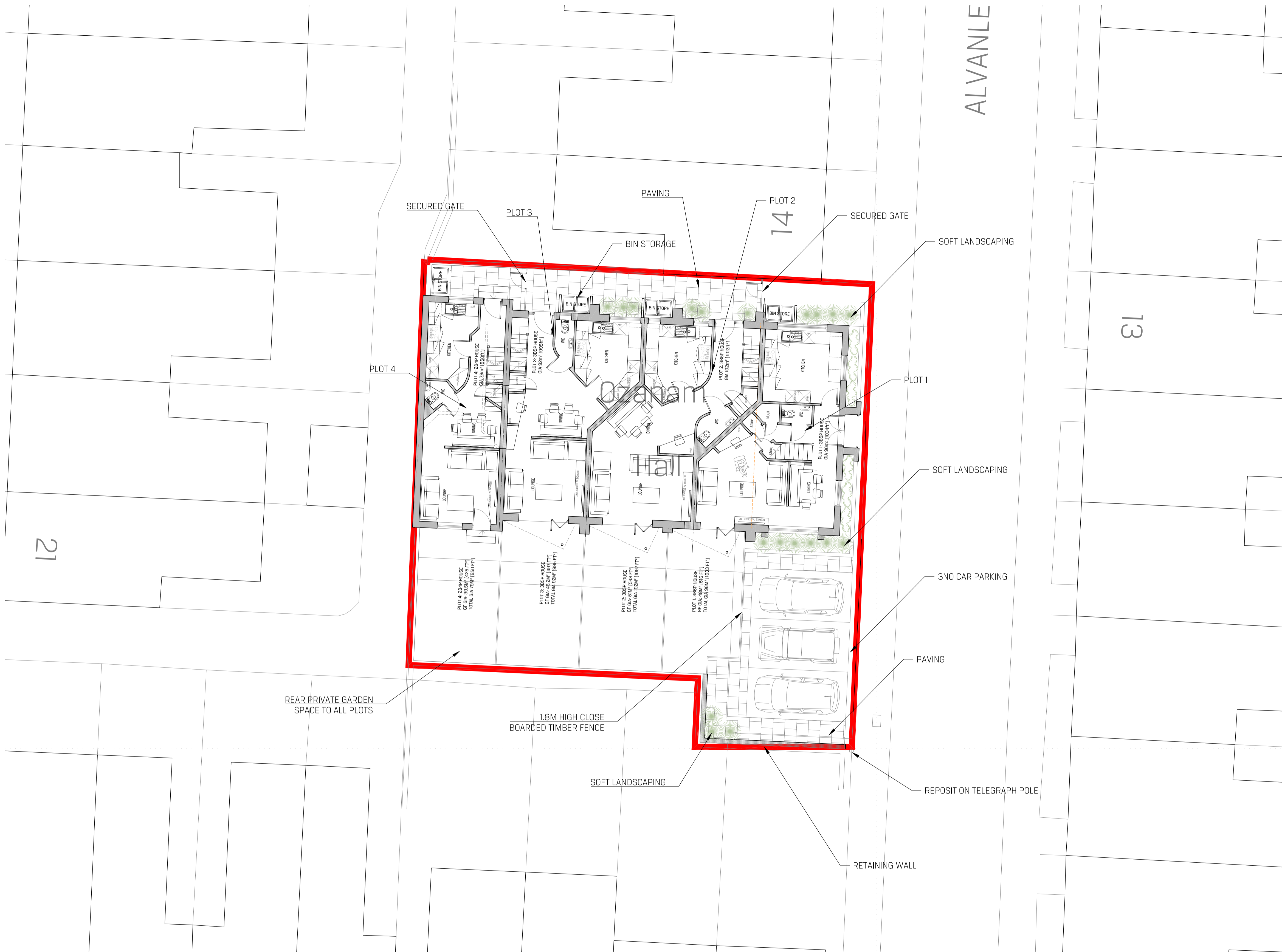
PROPOSED PLAN ON SITE | SCALE 1:100